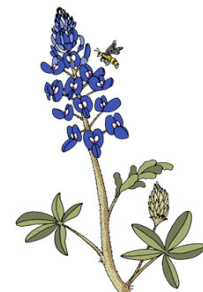
Texas State Flower: BLUEBONNET

At the state and local levels, the 2010 figures will be compared to figures from the 2000 Census to determine whether voting district boundaries need to be redrawn to reflect shifts in population (redistricting). In addition, funding for highway safety, public transportation systems, roads and bridges as well as school construction, community facilities, and a variety of programs are determined based on the results of the census.